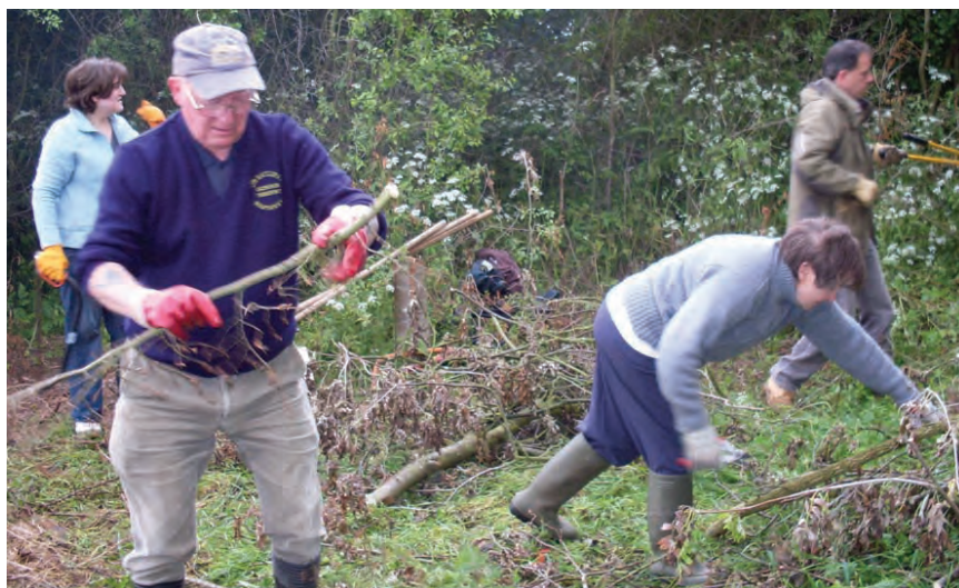
Members of Mepal Allotment & Leisure Garden Association undertaking clearance work to the land allocated for allotments on Mepal recreation field.