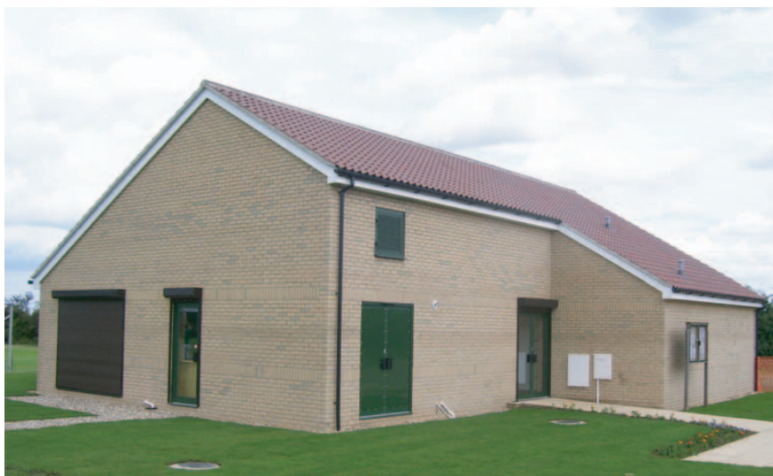
Community Pavilion opened July 2007. A £275k project completed within budget. Supported and funded by Mepal Sports Action Group, The Football Foundation, East Cambridgeshire District Council, WREN, the Grant Weston Trust, Cambridgeshire ACRE and Donarbon.