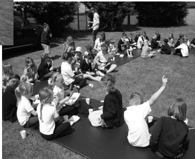
A visit from Redtail Falconry and a Chipnic lunch